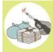
Suspicion of arson