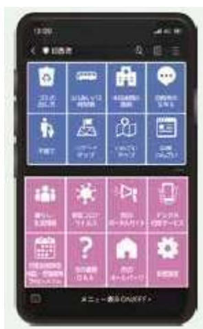
Image of Talk Head View