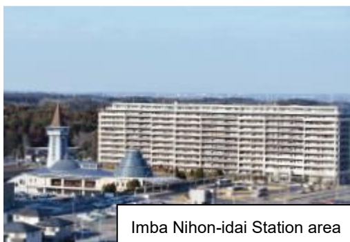
Imba Nihon-idai Station area

You can submit your opinions through the Chiba Electronic Application Service, and we are looking forward to your active participation. For more details, please visit the city's official website.