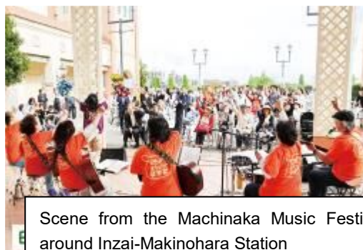
Scene from the Machinaka Music Festival held around Inzai-Makinohara Station