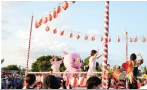
Scene from the Inzai Summer Festival held at the Kioroshi Ekimae Nigiwai Hiroba