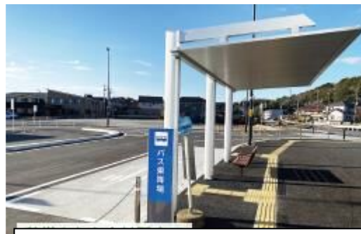
The developed South Exit of Kobayashi Station